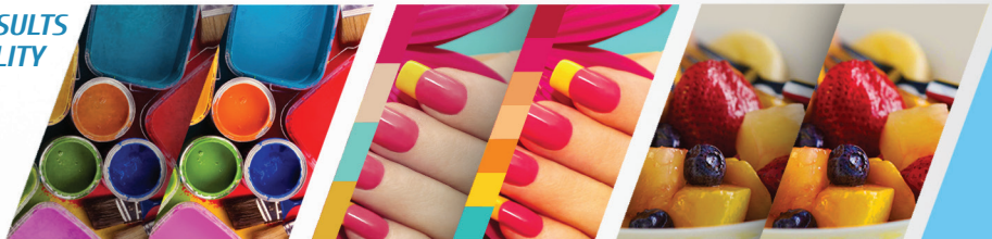
Less mottled effect

THREE-WAY HEATING RESULTS IN SUPERIOR IMAGE QUALITY